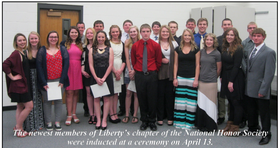
The newest members of Liberty's chapter of the National Honor Society were inducted at a ceremony on April 13.